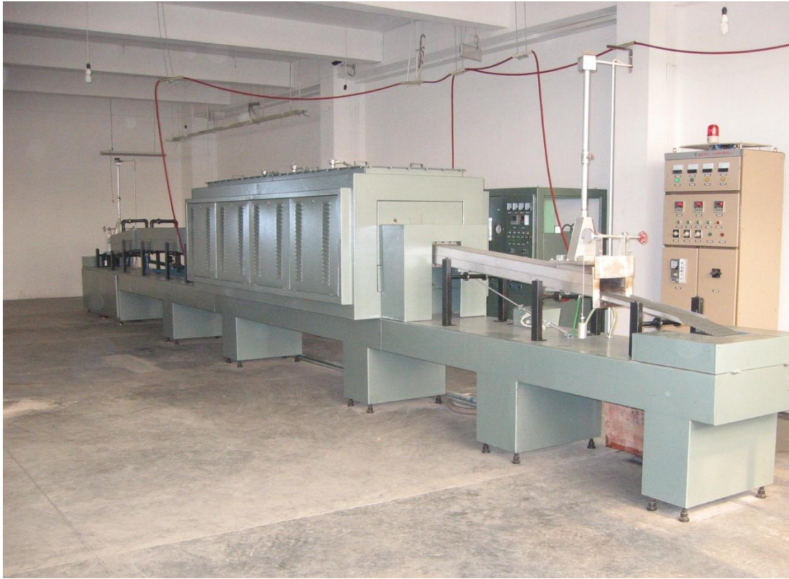
State-of-the-art atmosphere braze oven