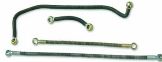
PA11 nylon hose